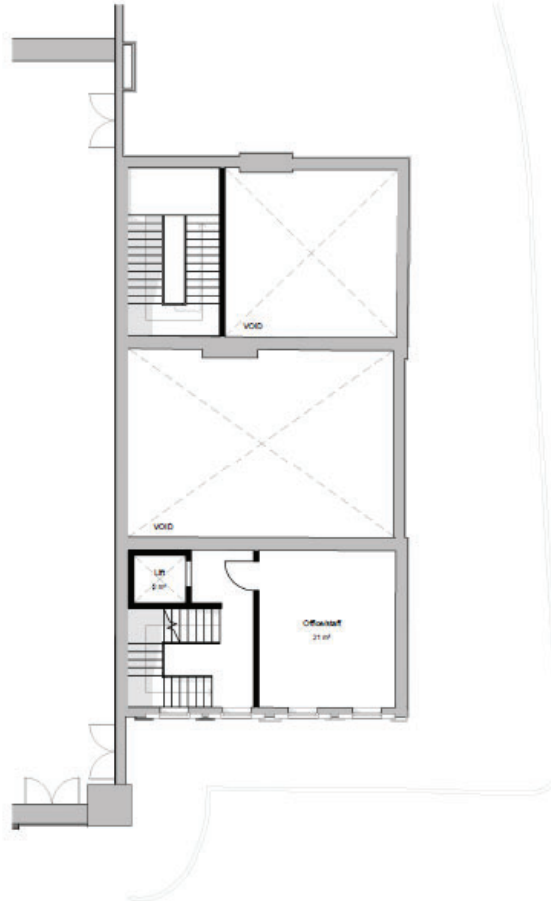
PROPOSED FIRST FLOOR