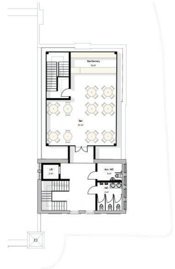
PROPOSED SECOND FLOOR