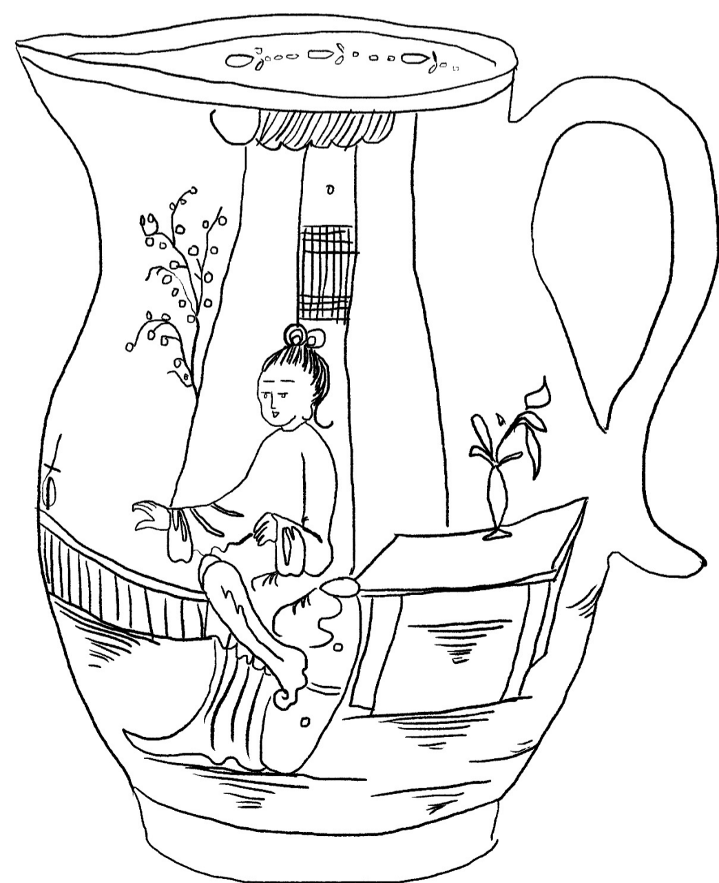
Sketch of Lowestoft Porcelain in 'Chinese style'

A sculpture trail within Lowestoft would provide a great opportunity for the local community to reflect on and experience Lowestoft culture. For example references to the Lowestoft's Porcelain factory could be encouraged since it had a huge impact on the development of the town. The factory also had broader cultural implications that would be good to explore more critically.