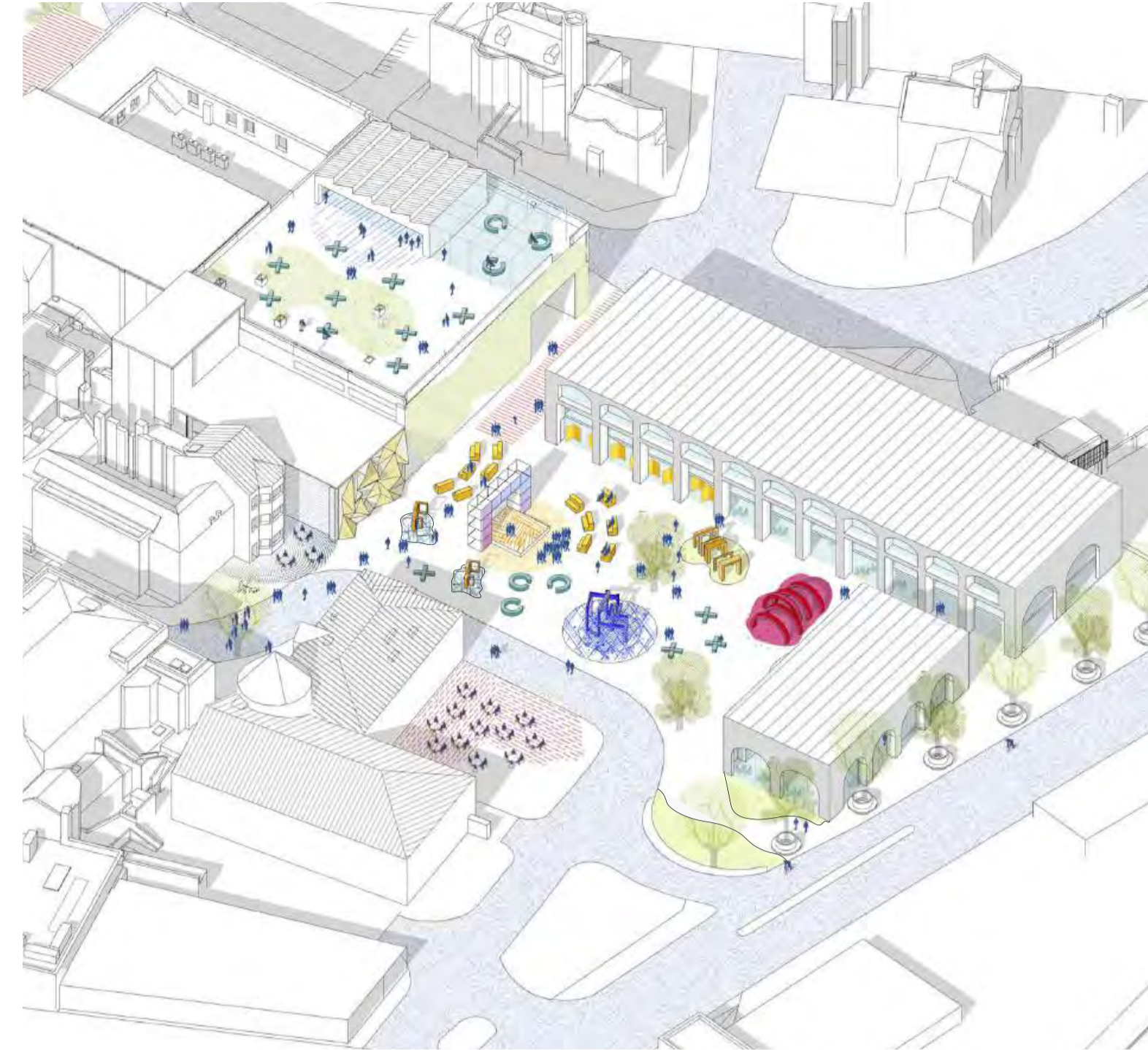
Reduced Public Realm