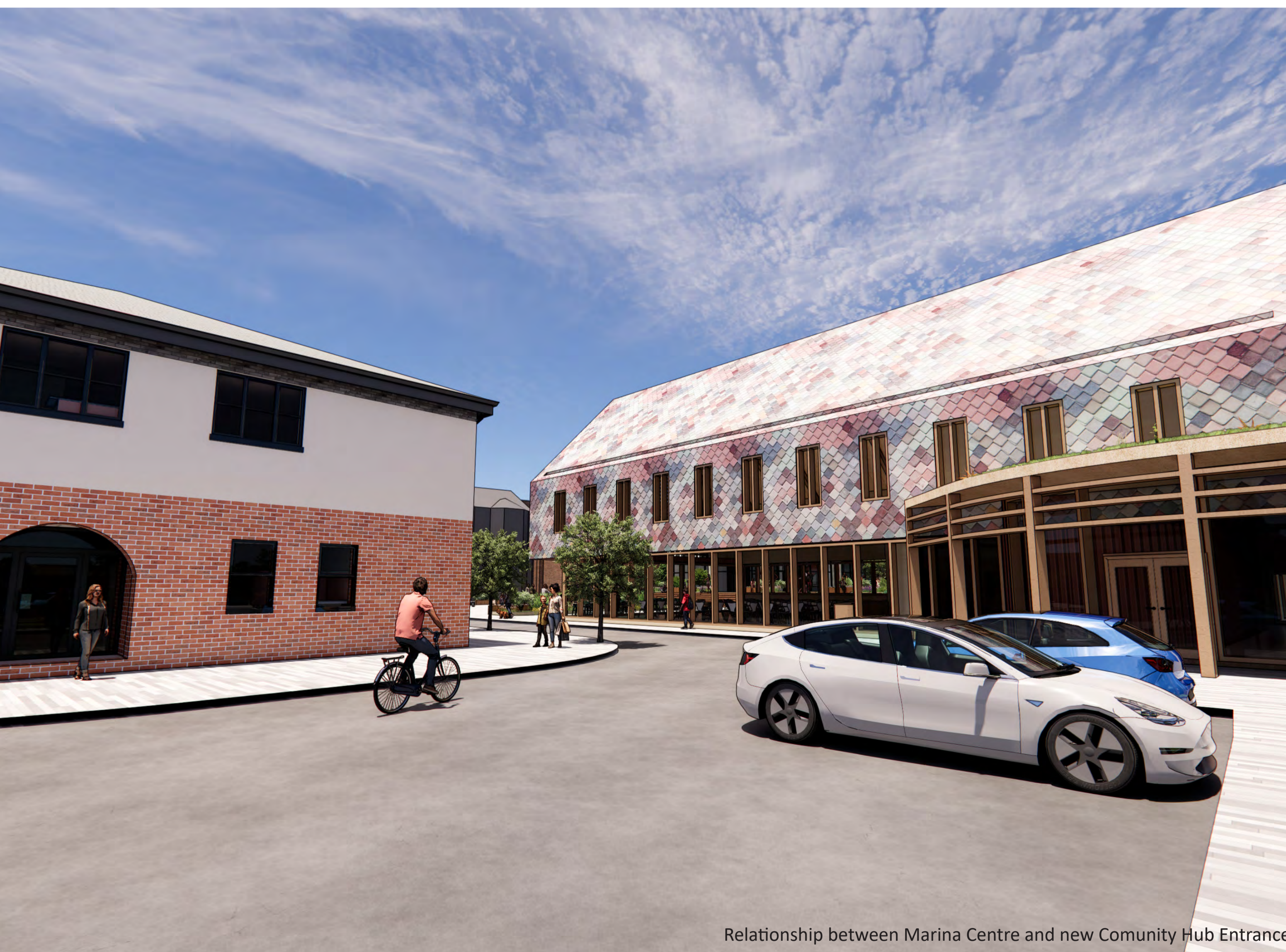
Relationship between Marina Centre and new Community Hub Entrance