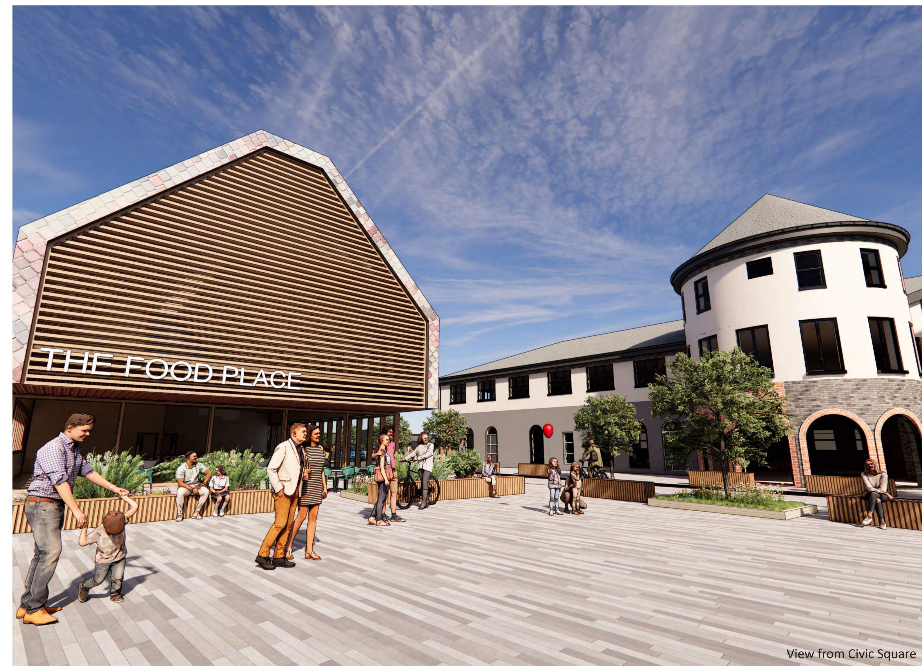
View from Civic Square