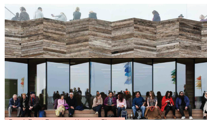
Beach Front Example - Hastings Pier