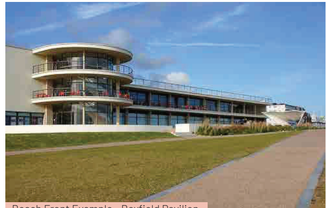
Beach Front Example - Bexfield Pavilion