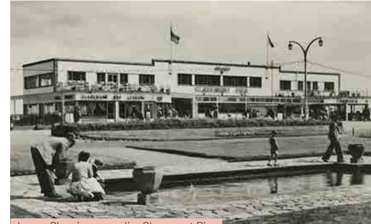
Historic View to the Beach