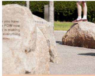
Reference: Gabbro-type boulders