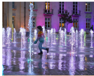
Reference: Fountains in the evening