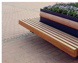
Reference: Raised planters with integrated seating