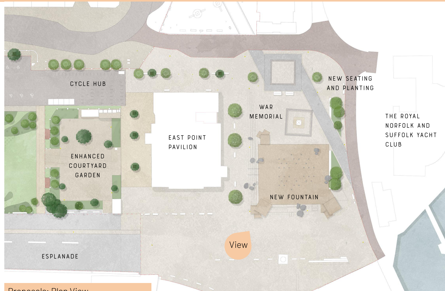
Proposals: Plan View

The planting proposals feature evergreen trees, with colourful seaside plants including native Suffolk and Norfolk coastal species. Pines, holm oak and strawberry tree are planted in clusters to provide shelter, while wind-tolerant grasses and colourful exotic perennials ensure planting is well-adapted to the exposed conditions, and is drought tolerant and robust. These also provide year-round interest and presence, with emphasis on colour and movement in the summer holiday season.