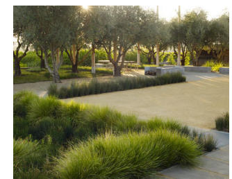
Reference: Courtyard Garden