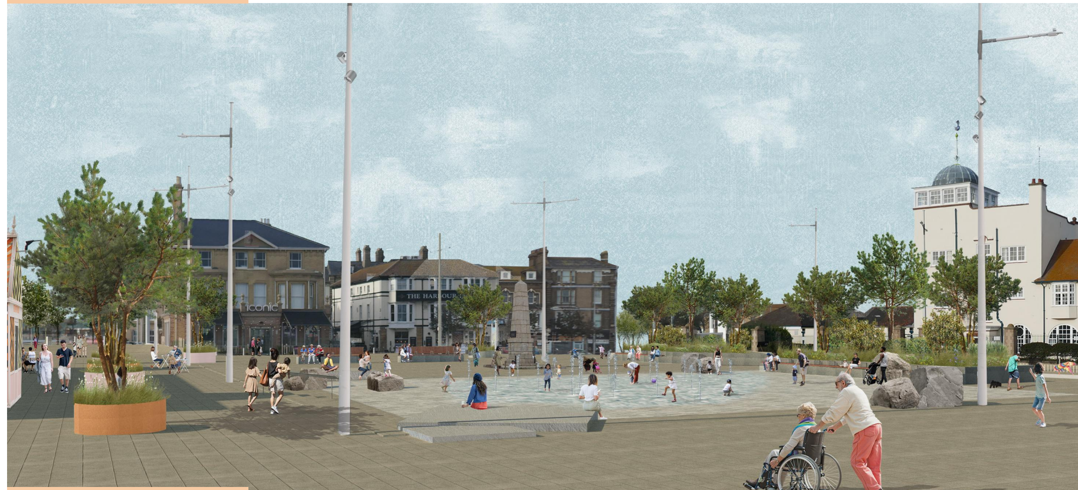
Artistic impression of Royal Plain