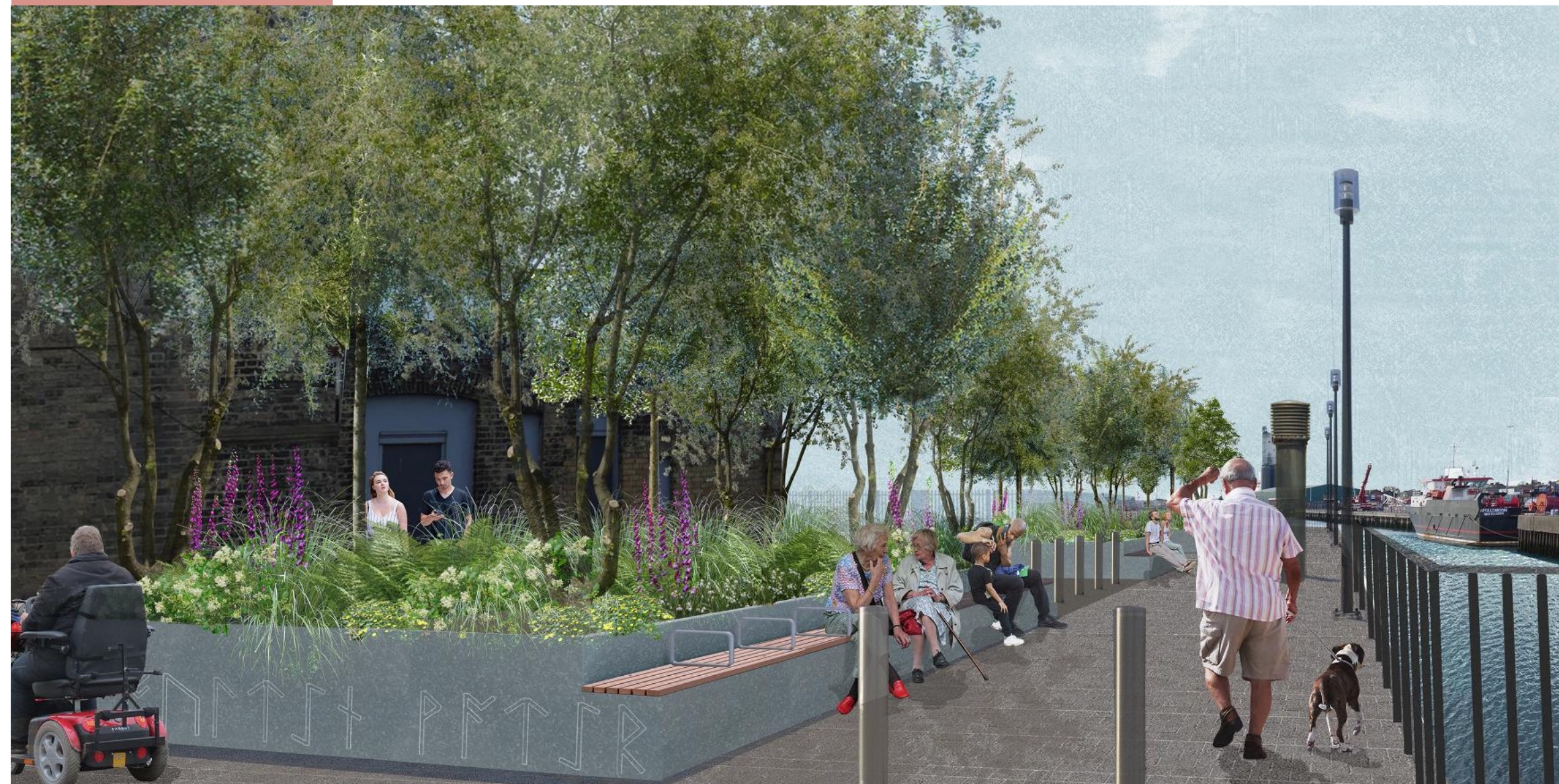
Artistic impression of South Quay